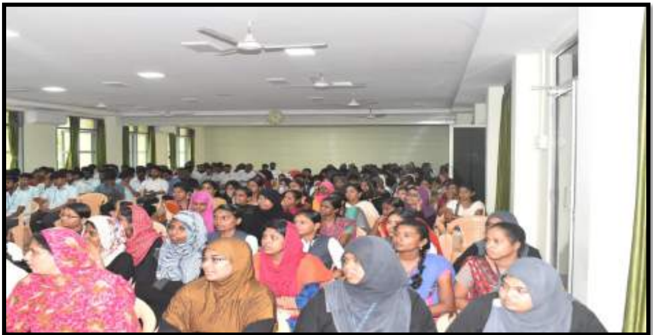
Interactive Session on the Skill Development Programme