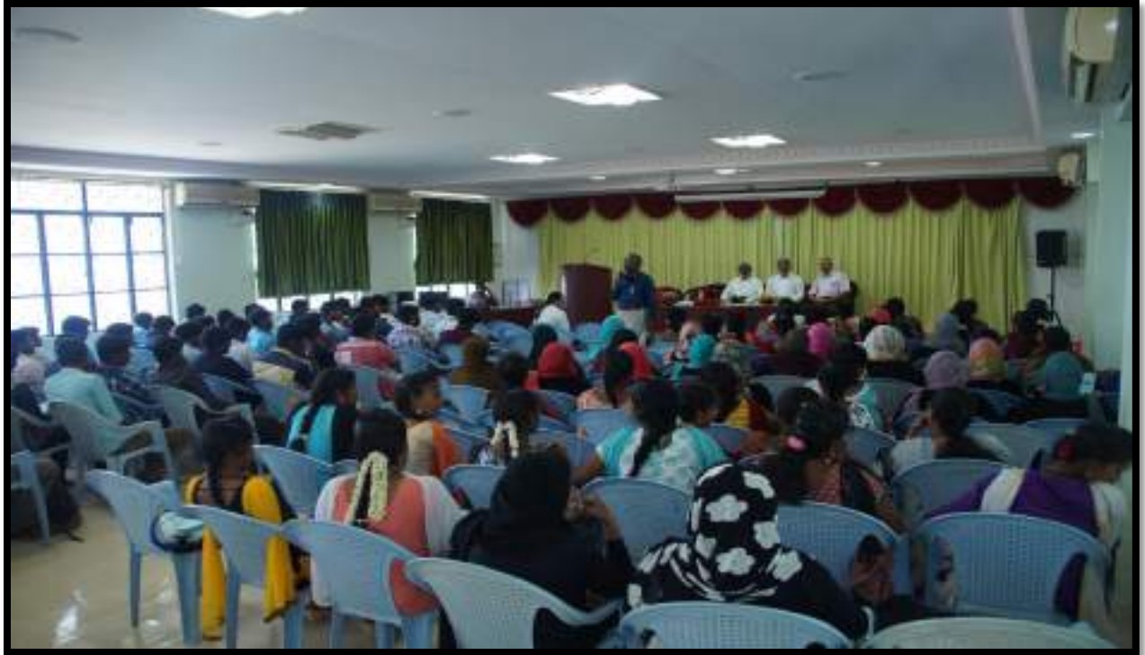
Interactive Session on The role DIC in Entrepreneurial Development