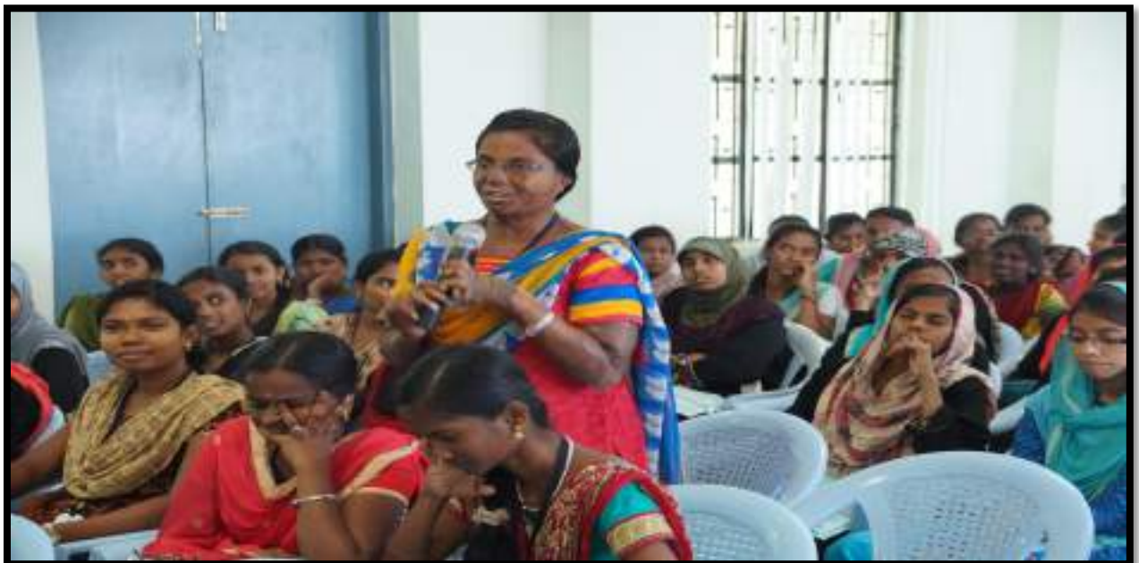
Student Interaction with the Resource Person