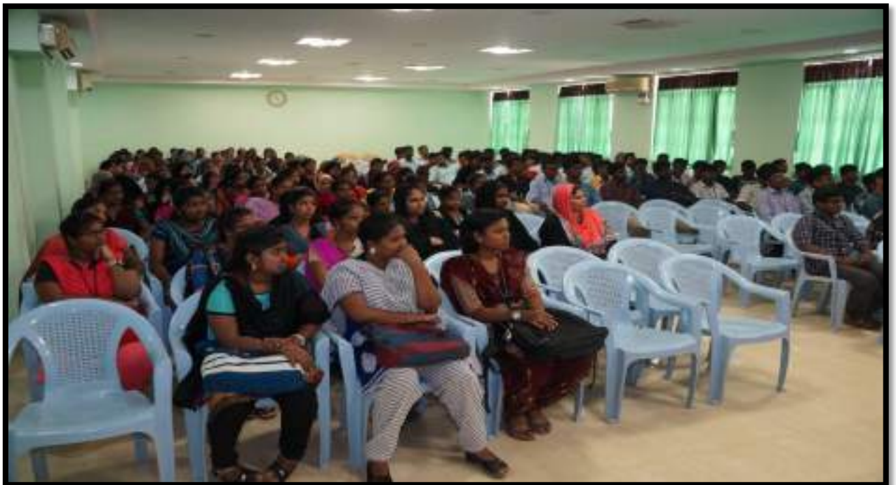
Interactive Session on the Motivational Programme