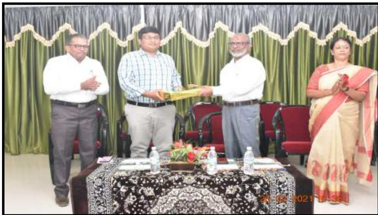
Memento Presentation to the Chief Guest