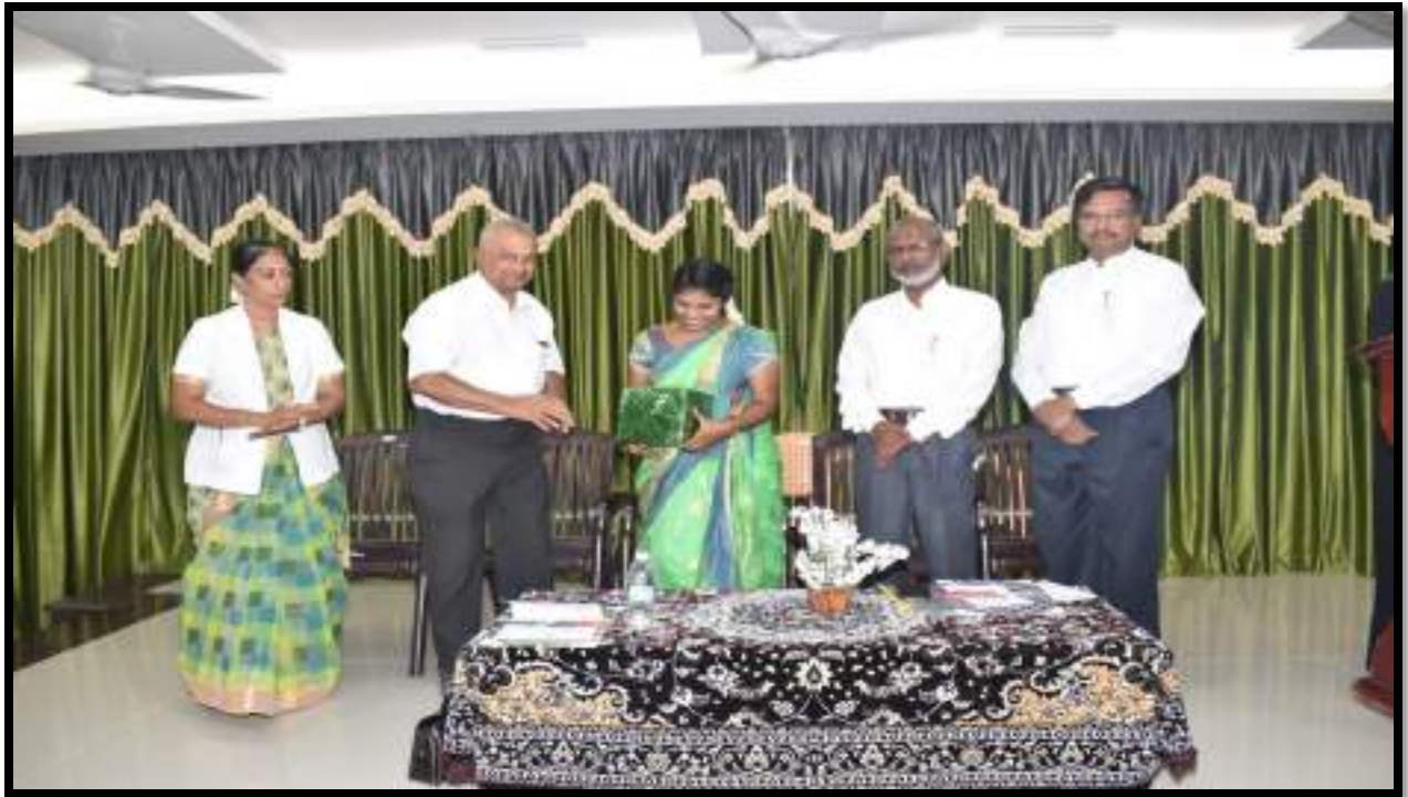
Memento Presentation to the Chief Guest