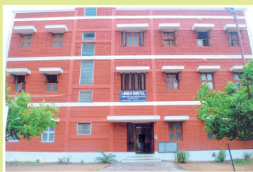
GIRLS' HOSTEL - I