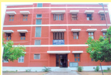
GIRLS' HOSTEL - I