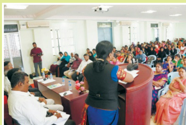
AIR CONDITIONED SEMINAR HALL