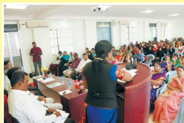
AIR CONDITIONED SEMINAR HALL