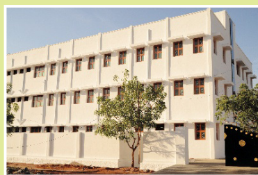
GIRLS' HOSTEL - II